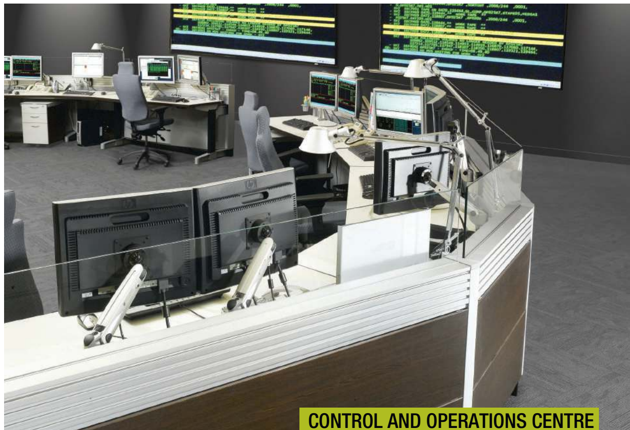
CONTROL AND OPERATIONS CENTRE

The centre's highly sophisticated equipment includes oversized peripheral monitors, a screen wall for daily data analysis, and specialized furniture for administrative functions.