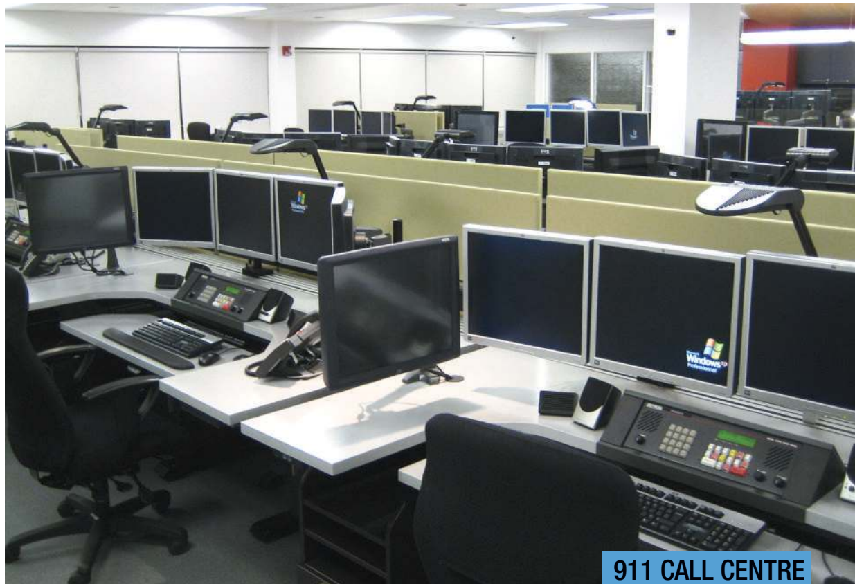
911 CALL CENTRE